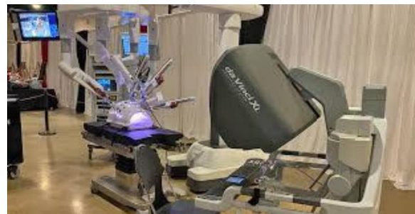
Figure 1: Da Vinci Surgical System. 2

sensory data, enabling the execution of more complex tasks with greater precision. However, fully autonomous robotic surgeons remain a goal for the future, as replicating the sensorimotor expertise of skilled human surgeons continues to pose significant technological challenges. Greater autonomy also raises critical concerns regarding safety, regulation, and liability—especially in high-risk procedures. 1