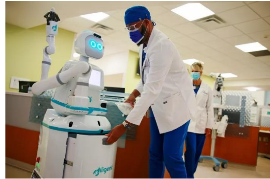
Figure 3: Moxi, the AI-powered robot nurse assistant. 7

Beyond surgery, robotics is playing an increasingly vital role across various healthcare sectors. AI-powered robotic nurses are assisting in patient monitoring, medication administration, and rehabilitation, enhancing both efficiency and care quality. In hospitals, autonomous robots are being deployed for logistical tasks such as delivering medical supplies and disinfecting rooms, thereby helping to reduce the risk of infection. Additionally, robotic exoskeletons are supporting rehabilitation for patients with spinal cord injuries and stroke-related disabilities, enabling them to regain mobility and independence. 6