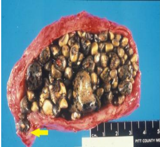
Figure 3: Postoperative picture of gallstones